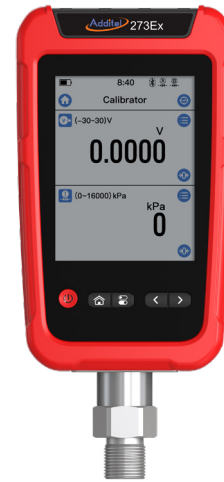
Additel 273Ex with ADT158Ex module