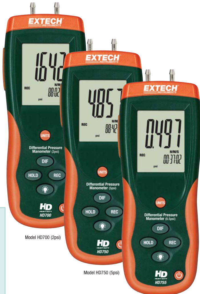
Model HD700 (2psi)