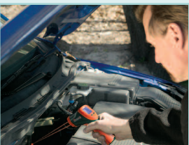
Max hold indicates and holds the peak temperature for easy identification of hot spots