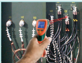
Fast response captures hot spots