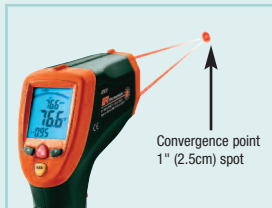
Two laser points converge at a distance of 50"/(127cm) and form a 1" (2.5cm) spot.