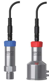
Gauge pressure Differential pressure