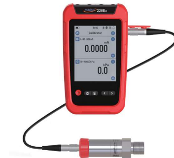
Additel 226Ex with ADT161Ex Pressure Module