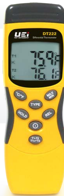
DT222 Digital Thermometer

J Type Bead Temperature Probe, 9V Battery, Manual