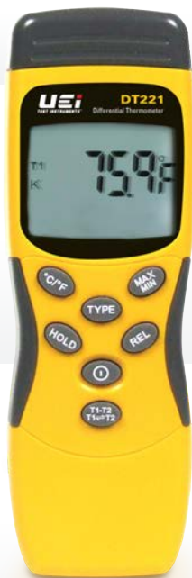
DT221 Digital Thermometer