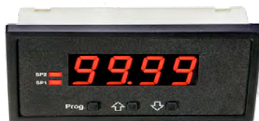
Optional Remote Display Programmer Needed for Programming Relays