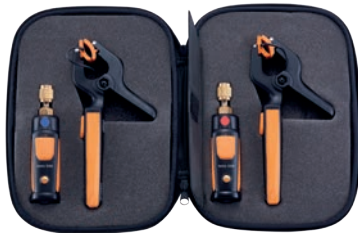
Refrigeration Smart Probe Kit: 0563 0002