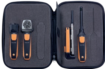
VAC Smart Probe Kit: 0563 0003