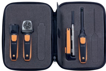
VAC Smart Probe Kit: 0563 0003