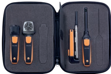
VAC Smart Probe Kit: 0563 0003