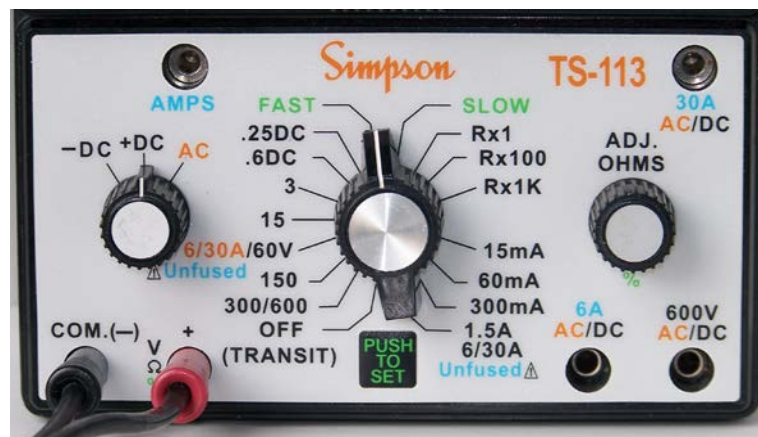
Figure 7. Measuring Percent “ON” Time