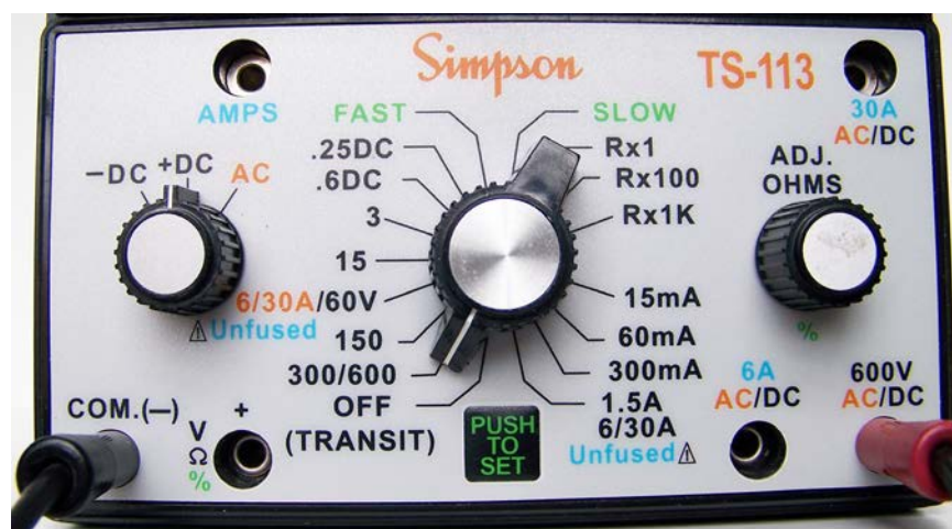
Figure 5a. Measuring High AC or DC Volts