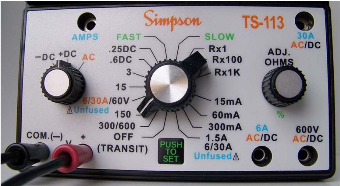
Figure 5. Measuring AC or DC Volts

To determine the peak value of a visibly fluctuating reading, slowly rotate the pointer stop knob clockwise against the pointer until pointer motion can no longer be detected. The pointer is then indicating the peak value of the energy being applied.