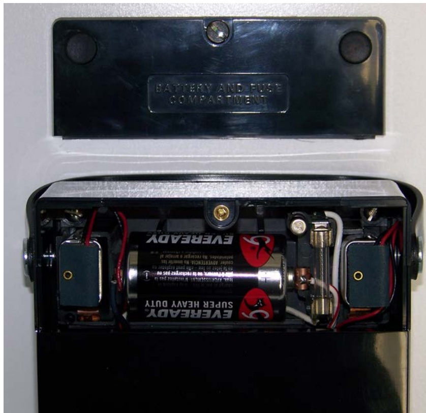
Figure 2. Rear View (Battery Cover Removed)

Precise, gradual adjustment of zero ohms is made possible by the right hand knob . This control is also used to set the 100% reading for “ON” time measurements, when used together with the “Push to Set” switch. With the button depressed the right hand knob now adjusts the “ON” time full scale.