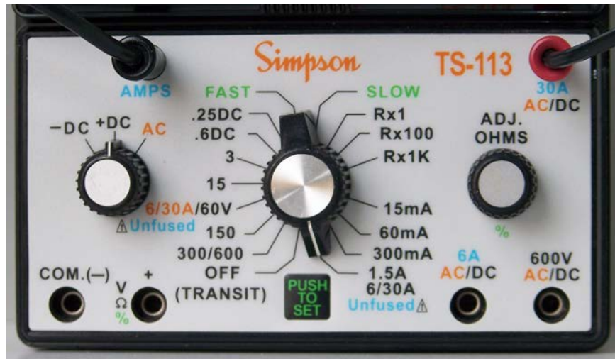
Figure 3. Measuring DC Current