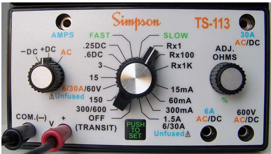
Figure 6. Resistance Measurements

Branch and distribution circuits (120/240/480V etc.) can deliver dangerous explosive power momentarily into a short circuit before the fuse/breaker opens the circuit. Make absolutely certain that the Instrument switches are set properly, jacks are connected properly, and that the circuit power is turned off before making connections to such circuits.