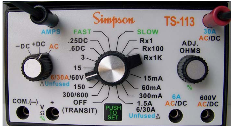
Figure 4. Measuring AC Current