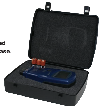
PT-120 with included protective carrying case.