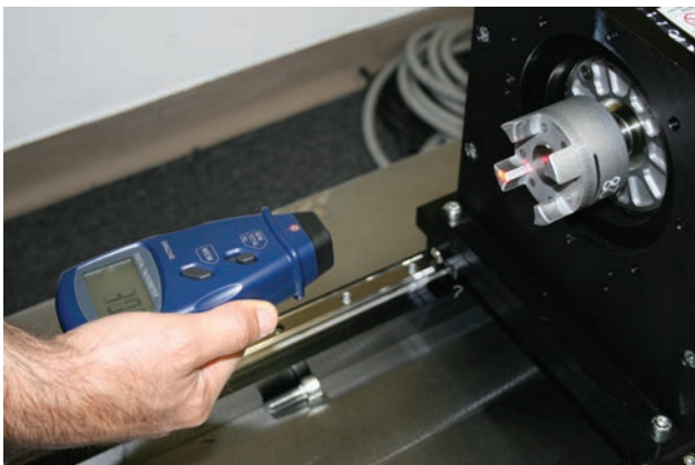
PT-110 recording rotational speed of machinery.