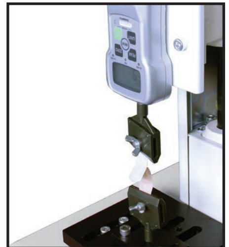
Stand with Optional Grip Performing Peel Test