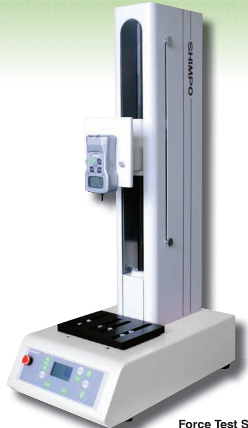
Force Test Stand shown with Force Gauge (Sold Separately)