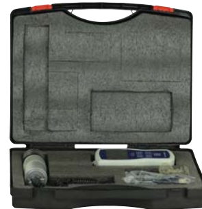
FG-7000T with Included Accessories and Carry Case