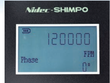
LED Panel Display Close-up