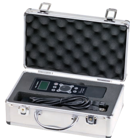
DT-326B in Included Protective Carry Case.