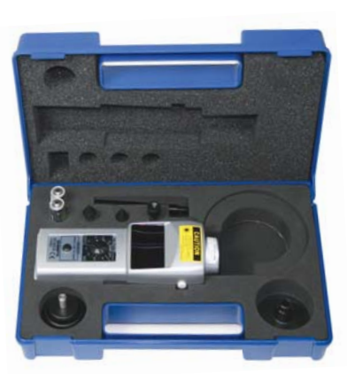
Standard DT-200LR in Supplied Case

DT-207LR-S12 Contact Tachometer with Optional 12" Circle Wheel