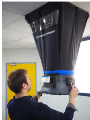
Use of the air flow meter