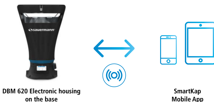
DBM 620 Electronic housing on the base

The DBM 620 housing communicates with the smartphone or tablet via wireless connection. This allows measured values reading and viewing of reports directly on your mobile device screen, via the dedicated SmartKap mobile application.