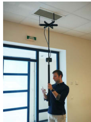
Use with the measurement grid