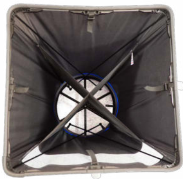
Hood with flow straightener