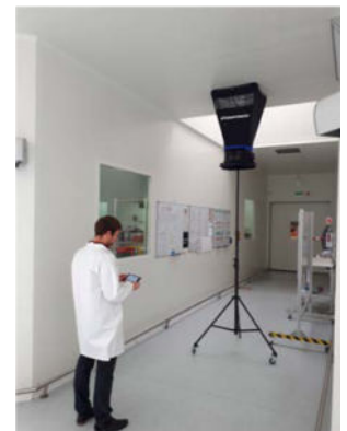
Use with the telescopic tripod