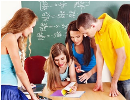
Indoor air quality