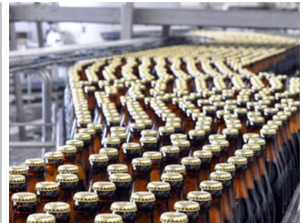
Leak monitoring in filling plants (safety)