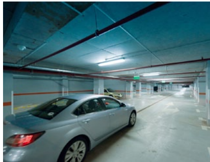
Monitoring in underground garages (safety)