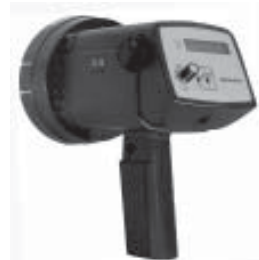
Nova-Strobe Vibration Strobe Series