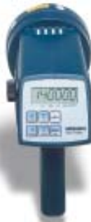
Nova-Strobe Phaser Strobe Series