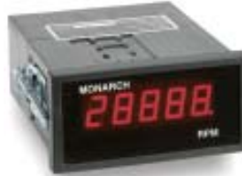
ACT Panel Tachometer Series