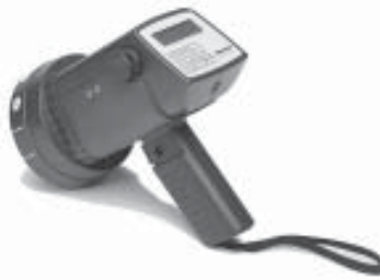
Nova-Strobe Digital Series