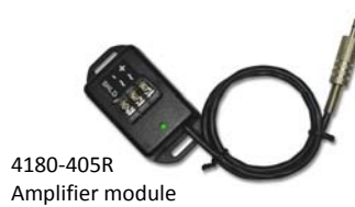
4180-405R Amplifier module

4180-405R Amplifier module, 3 foot cable with 3.5mm phone plug 4180-406R Amplifier module, 3 foot cable with 3 tinned leads