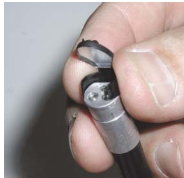
Figure 4 Mirror/Magnet Attachment

To attach the mirror or magnet: grasp the clip as shown in Figure 4, tilt while aligning against flat of the distal tip and push down into the recessed area.