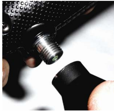
Figure 3 FSX Flashlight Attachment

Tip: The coupler has a Nitril O-ring which may need a thin film of silicone grease or Vaseline from time to time. This will facilitate the flashlight to slide in.