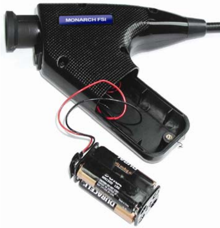
Figure 1 FSI-XX-10-L Battery Pack