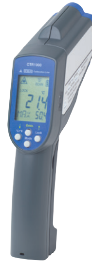
Infrared hand-held thermometer model CTR1000