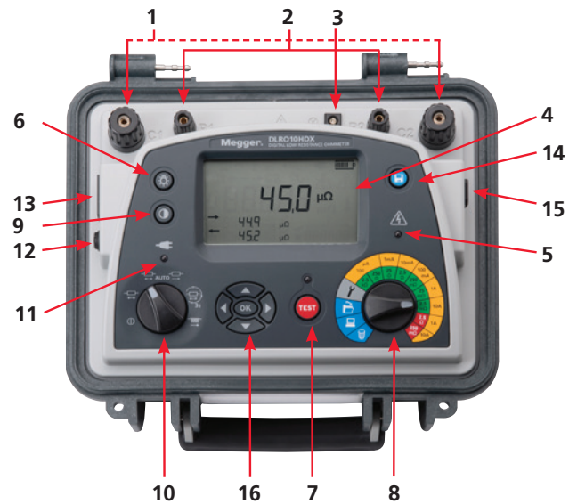
DLRO10HDX Instrument Overview