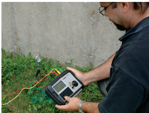
Model DET3TC shown performing the classic fall-of-potential test method.