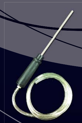
Extension probe is useful for hard-to-reach sampling points