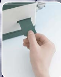
Easy sensor cleaning