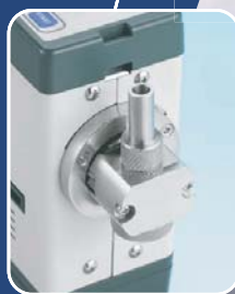
Impactors for 10 and 4 micron cut off