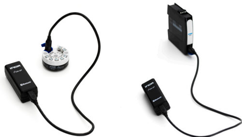
ICON-BT connected to a head mounted and a rail mounted transmitter.