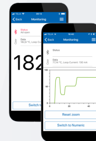
App: INOR Connect

Remote configuration and monitoring via Bluetooth®