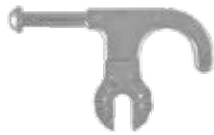
HOK-HS166 Disconnect hook (Optional)