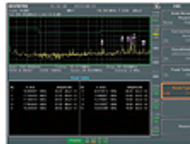
EMC Pretest Mode

GSP-9300 supports the fast sweep mode with sweep speed up to 307usec. Users can use the fast sweep mode to capture transient signals such as Tire-pressure monitoring system (TPMS), Bluetooth frequency hopping signals, tuned oscillator, and other interfering signals in ISM frequency band, etc