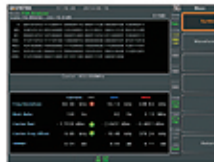
FSK Signal Demodulation & Analysis

All active components have linear dynamic range for power output. Once output power reaches the maximum level, active component will enter the non-linear saturated area of P1dB point and cease amplifying signal intensity as well as produce harmonic distortion. It is very useful for P1dB point measurement in active components such as low noise amplifier, mixer and active filter.