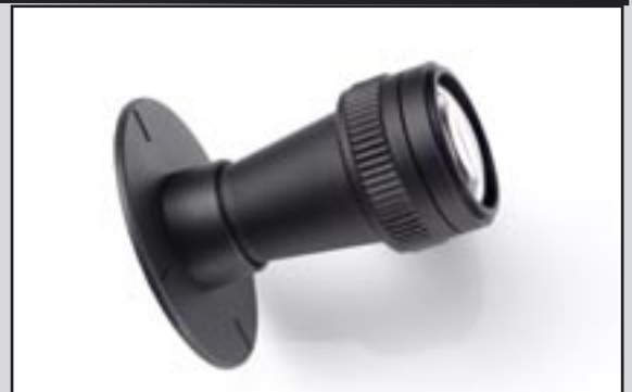
Measuring probe for contact measurements