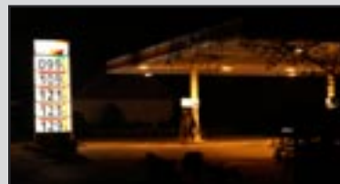
Measuring light immissions