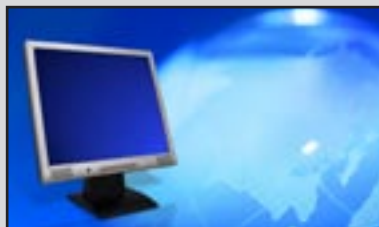
Measuring the reflections at monitors