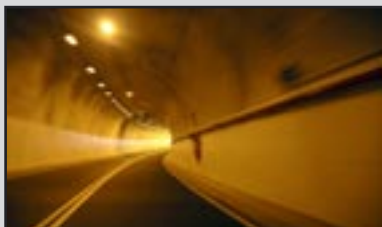
Lighting of tunnels