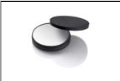
GOSSEN Reflexion Standard