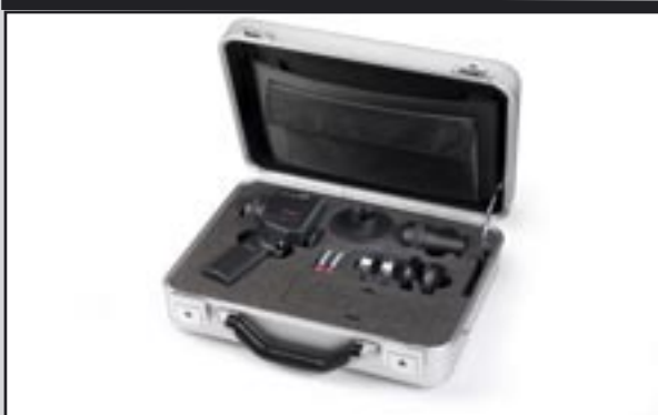
The MAVO-SPOT 2 USB is supplied in a practical, strong aluminum transport case