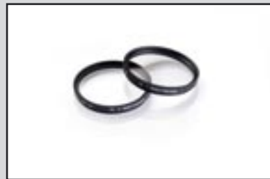
Close-up lenses 1 and 2