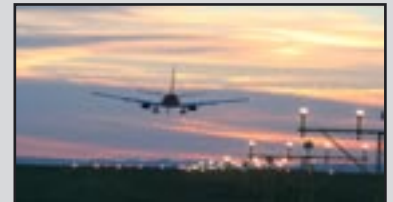
Measuring airfield guidance lights