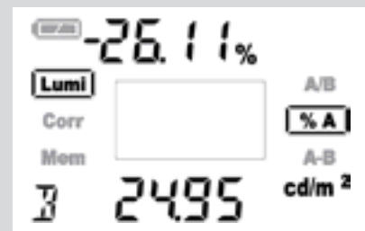
Luminance ratio measurement percentage % A