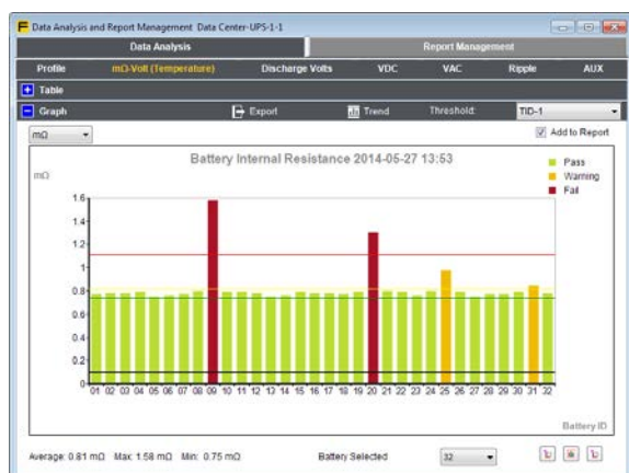
Histogram of a battery string with user defined threshold.