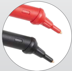
Intelligent test probe with integrated LCD display