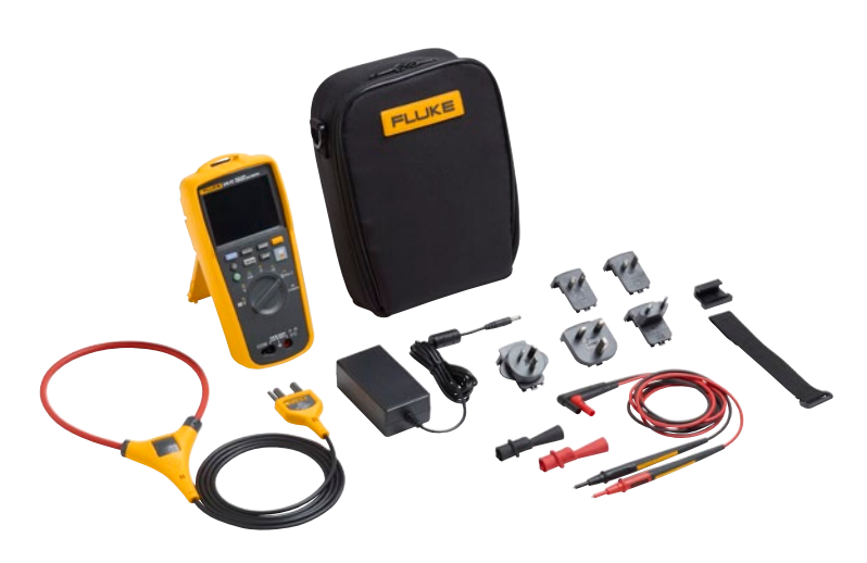
Figure 2. Fluke 279 FC/iFlex TRMS Thermal Multimeter Kit