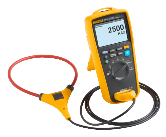
Figure 1. Fluke 279 FC with the iFlex Flexible Current Probe