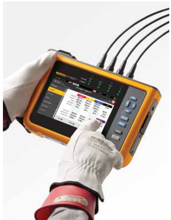
Easily navigate using the large color touchscreen

When downloading data from the Fluke 1770 Series Power Quality Analyzers the included Energy Analyze Plus software package can compare measured voltage and current harmonic statistical data to different standards, like EN 50160 or IEEE 519, to determine if they exceed compliance limits. This powerful predictive maintenance feature enables current harmonics to be observed before distortion appears in the voltage allowing you to prevent unexpected failures or non-compliance situations and increase system uptime. With the proliferation of inverter-based loads and power generation, keeping current harmonics in check is becoming increasingly critical to ensure reliable power quality and avoid system downtime.