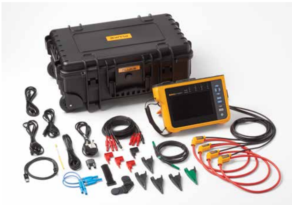
Fluke 1777 Power Quality Analyzer. Note: Included items vary by model and are listed in the “Ordering information” table.