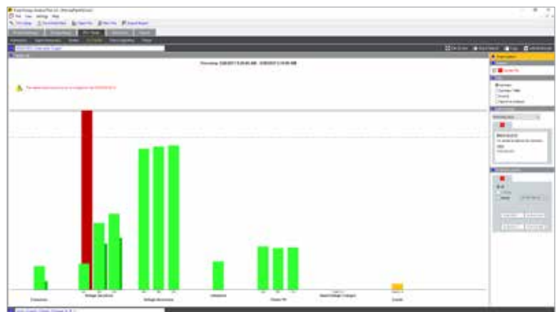
Fluke Energy Analyze Plus: Power quality health summary