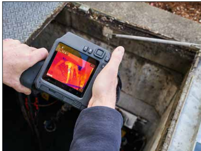
Up to 161,472 pixel resolution for accurate readings on distant targets