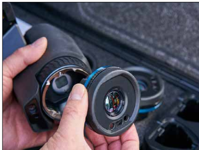
Share lenses (wide angle to telephoto) across your fleet of cameras thanks to AutoCal™ optics