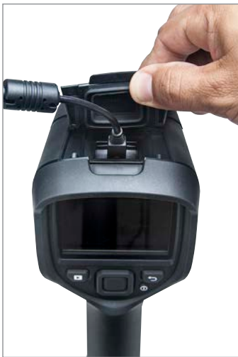
Download images fast via USB

Specifications are subject to change without notice.