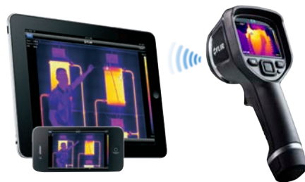
Wireless Connectivity to Smartphones, Tablets and more.

Equipment described herein may require US Government authorization for export purposes. Diversion contrary to US law is prohibited. Imagery for illustration purposes only. Specifications are subject to change without notice. ©2017 FLIR Systems, Inc. All rights reserved. (Updated Jan 24) 17-0072