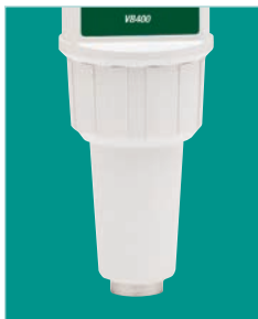
Magnetic base included