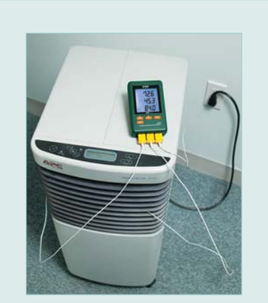
Simultaneously record and time stamp multiple temperature readings.