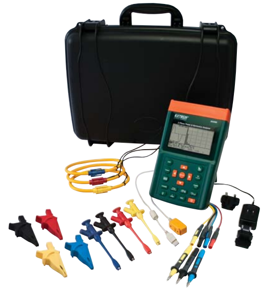
Includes (3) flexible current clamps, (4) voltage leads with alligator clips and retractable plunger clips, 8 AA batteries, universal AC adaptor, software, USB interface cable, and case