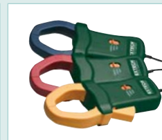
Model PQ3120 1000A Current Clamp Probes with 2.2" (55mm) jaw opening

1200A (12"/304mm) or 3000A (24"/609mm) Flexible Current Clamp Probes for wrapping around busbars