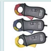
Model PQ3110 100A Current Clamp Probes with 1.2" (30mm) jaw size