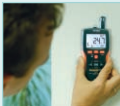
Measure moisture of wall material with non-invasive Pinless technology