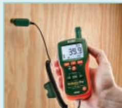
Pin Moisture Probe included for making contact moisture measurements