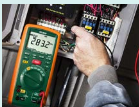
Voltage check on motor starter