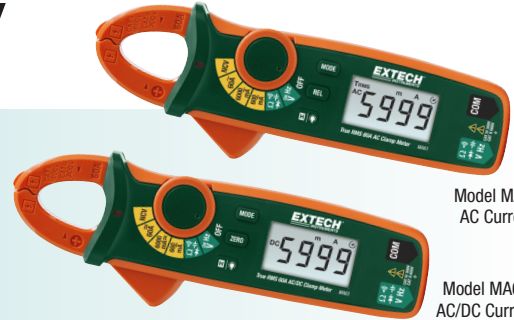
Model MA61 AC Current