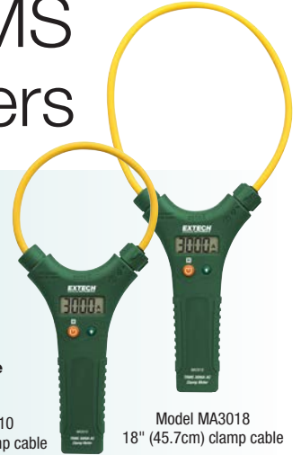
Model MA3018 18" (45.7cm) clamp cable