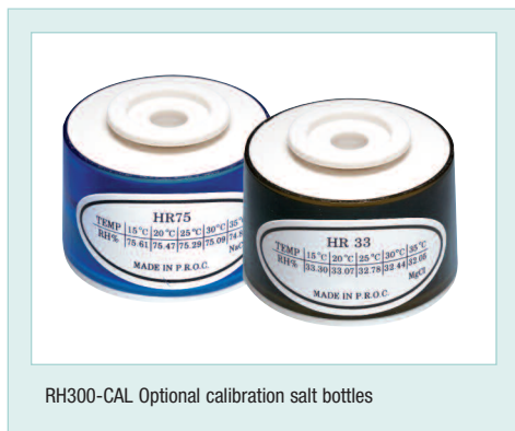
RH300-CAL Optional calibration salt bottles