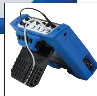
Ease and Wire Management

7" color, wide screen touch display. 40% larger than before - the largest in the industry!