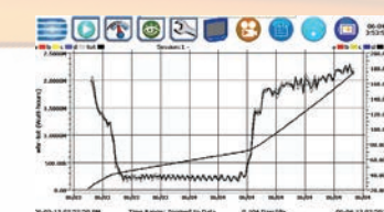
Demand & Energy Trend

Dran-View® 7 is our industry leading Windows-based software program that enables power professionals to simply and quickly visualize and analyze power monitoring data. Dran-View enhances the Dranetz HDPQ Guide with its advanced analytical capabilities. It is successfully used by thousands of customers around the world, and has become the industry leading power management software tool. Dran-View is easy to use, yet adds tremendous value and power to our Dranetz HDPQ family of instruments. Of course Dran-View can trend and list data recorded by the instrument, but it also includes a built-in report writer, allows you to embed pictures, provides mathematical analysis tools, and even includes a rescue kit to help correct connection mistakes.