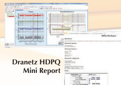
Dranetz HDPQ Mini Report