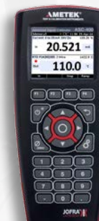
ASC300 ASC301 ASC321 ASC-400 ASC-400 BARO