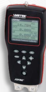
HPC500 HPC502 HPC600

When combined with these JOFRA calibrators, the APM is a powerful calibration tool.