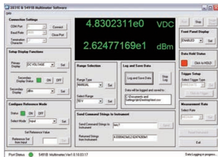
Application software screenshot

The 2831E and 5491B are programmable via USB and RS232 (5491B only) interface using industry standard SCPI commands. Users can control and configure the instrument from a remote PC and retrieve measurement results for further analysis. The meters can also be remotely controlled using application software (downloadable from the B&K website), which supports front panel emulation and data logging of measurement results.