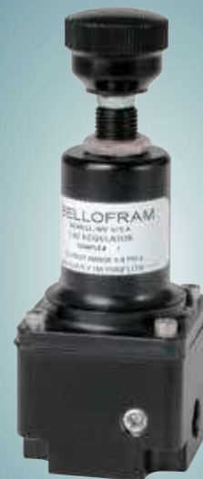
Type 92 Subminiature Regulator Series

The Type 92 Subminiature Regulator is a compact, low-cost unit which operates in pressure ranges up to 100 PSI, with a maximum supply pressure of 150 PSI. It provides dependable reliability and accuracy for low flow or dead end applications. The Type 92 subminiature regulator is available with a corrosion resistant anodized aluminum body and bonnet. Comes standard with a fluorocarbon diaphragm.