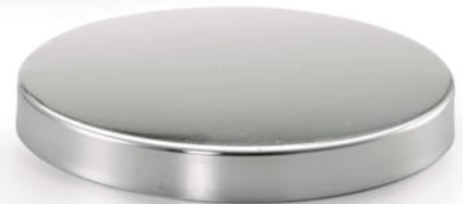
1084 3" dial size