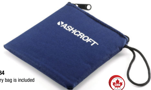
1084 Carry bag is included